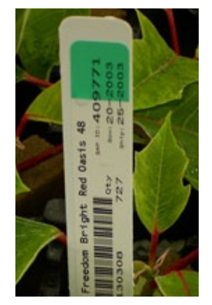
Technology is available to identify and track stock providing crucial information for business management

An important element of this definition of supply chain management is the focus on business relationships. The ultimate business relationship is and reducing costly errors. with the consumer, who parts