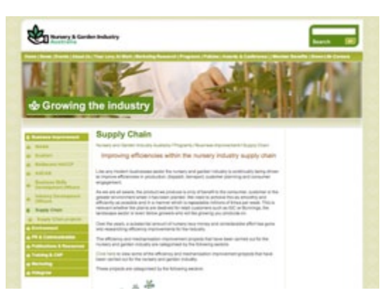
The supply chain webpage on the NGIA website www.ngia.com.au