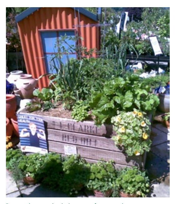
Responsive supply chains cater for emerging consumer interests, illustrated by this "grow your own vegetables" display.

The industry has access to resources to assist with this process and it is intended to produce more Nursery Papers to explore these in more depth.